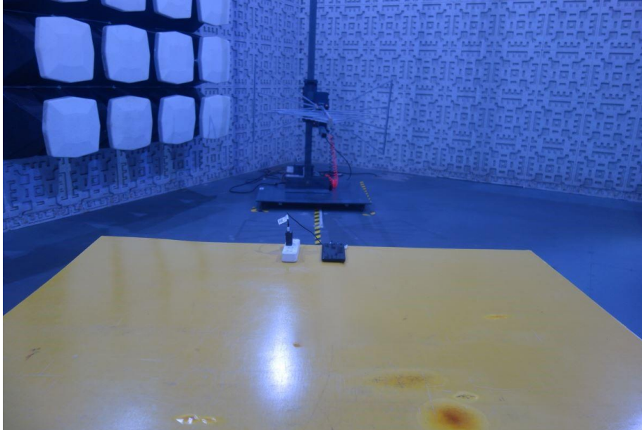
Field strength of spurious radiation(Above 1GHz)