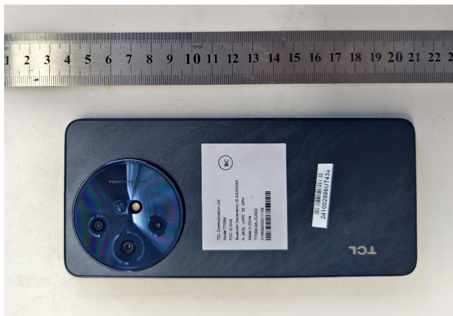
Pic 2 Mobile Phone(back)