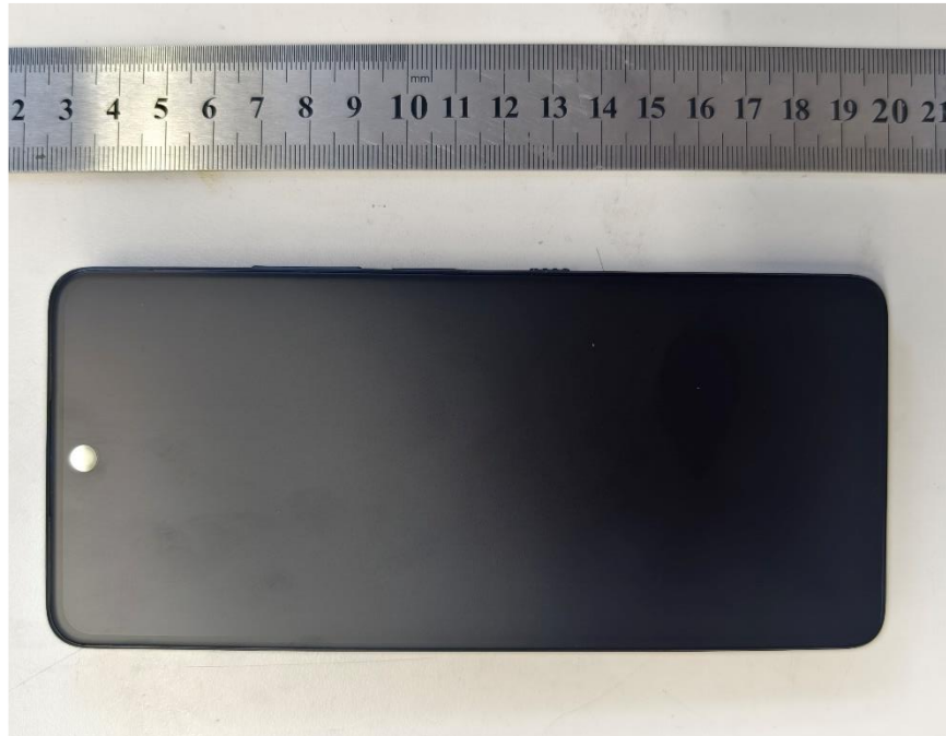
Pic 1 Mobile Phone(top)