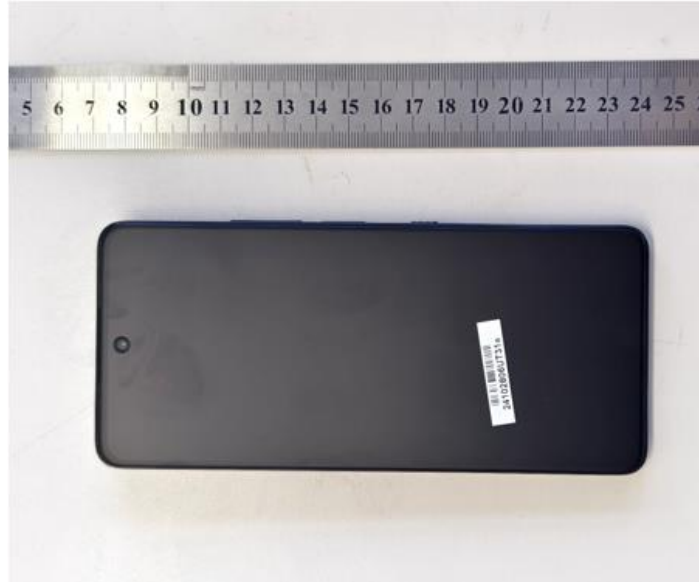
Pic 1 Mobile Phone(top)