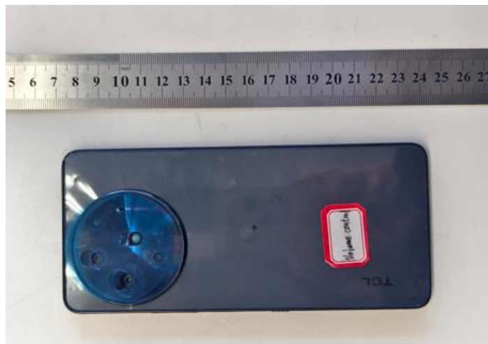
Pic 2 Mobile Phone(back)