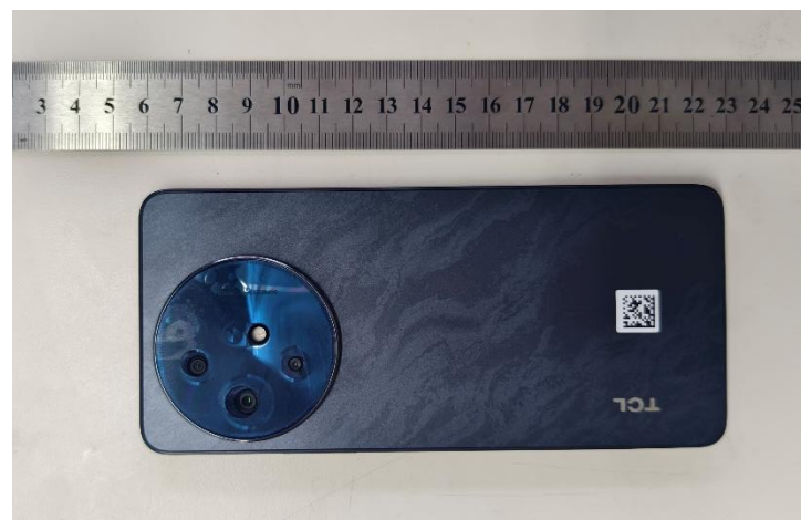
Pic 2 Mobile Phone(back)