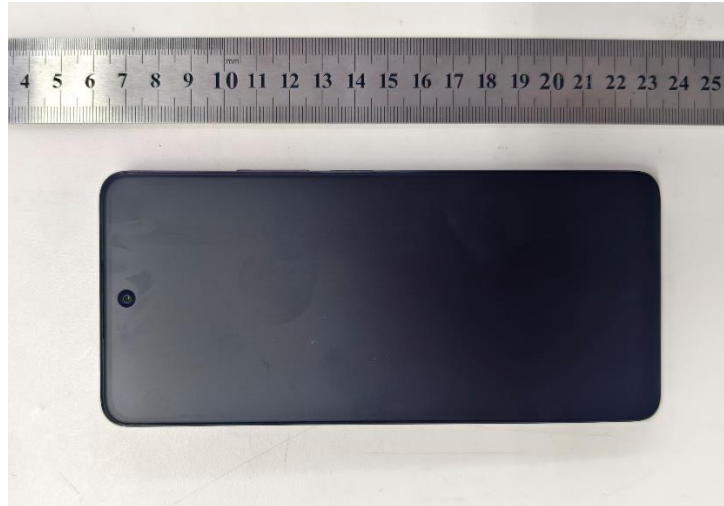
Pic 1 Mobile Phone(top)