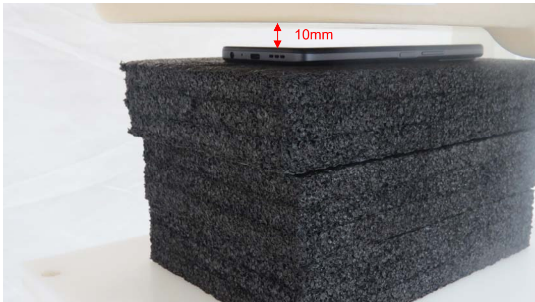
Picture 8: Front Side, the distance from handset to the bottom of the Phantom is 10mm