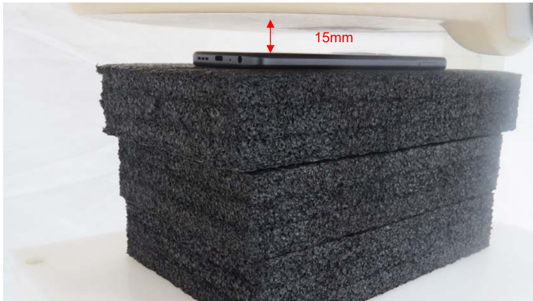
Picture 5: Back Side, the distance from handset to the bottom of the Phantom is 15mm