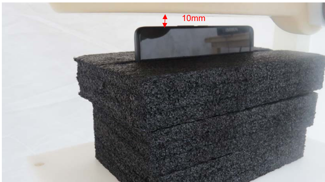
Picture 10: Right Edge, the distance from handset to the bottom of the Phantom is 10mm