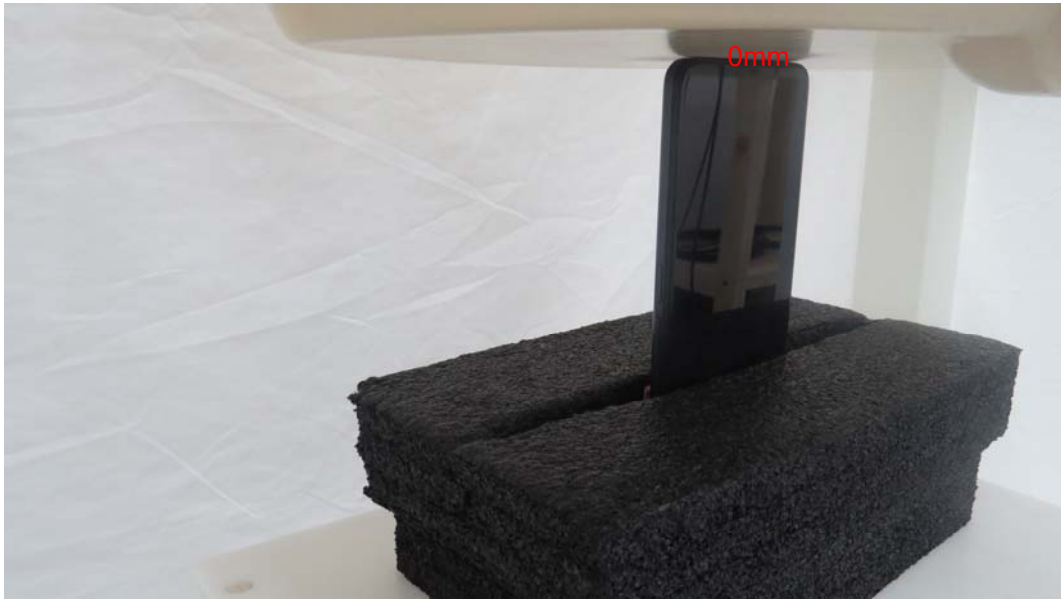
Picture 15: Bottom Edge, the distance from handset to the bottom of the Phantom is 0mm