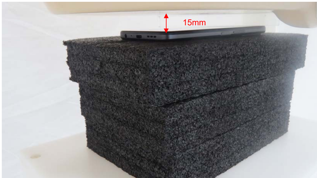
Picture 6: Front Side, the distance from handset to the bottom of the Phantom is 15mm