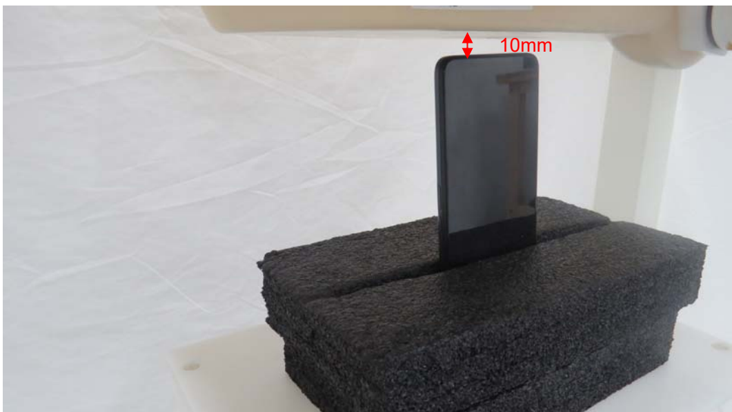
Picture 12: Bottom Edge, the distance from handset to the bottom of the Phantom is 10mm