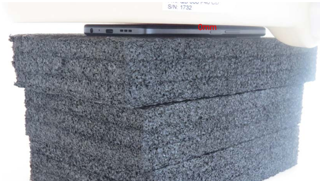
Picture 13: Back Side, the distance from handset to the bottom of the Phantom is 0mm