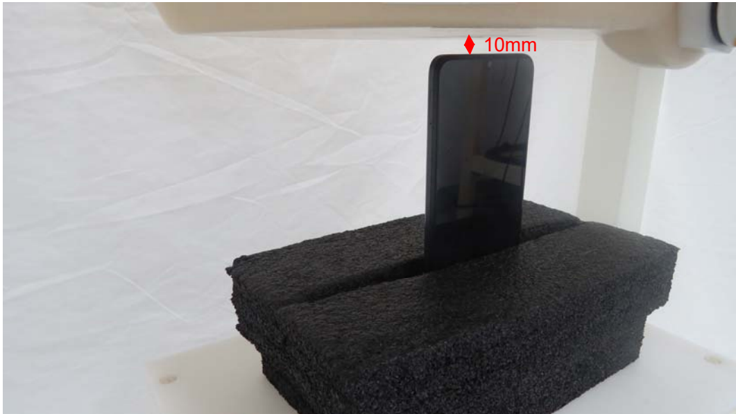
Picture 11: Top Edge, the distance from handset to the bottom of the Phantom is 10mm