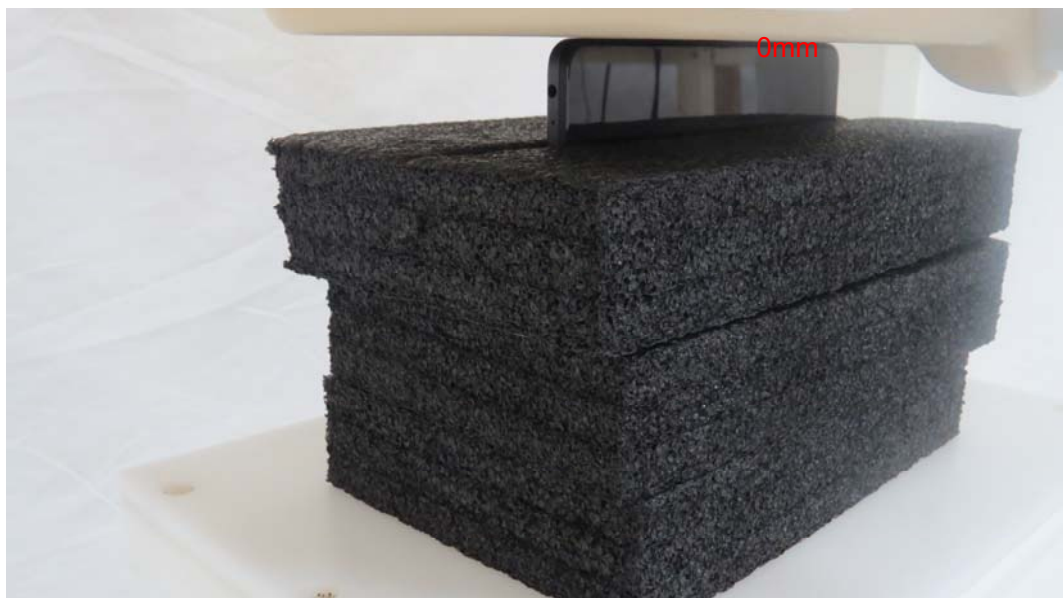
Picture 14: Left Edge, the distance from handset to the bottom of the Phantom is 0mm