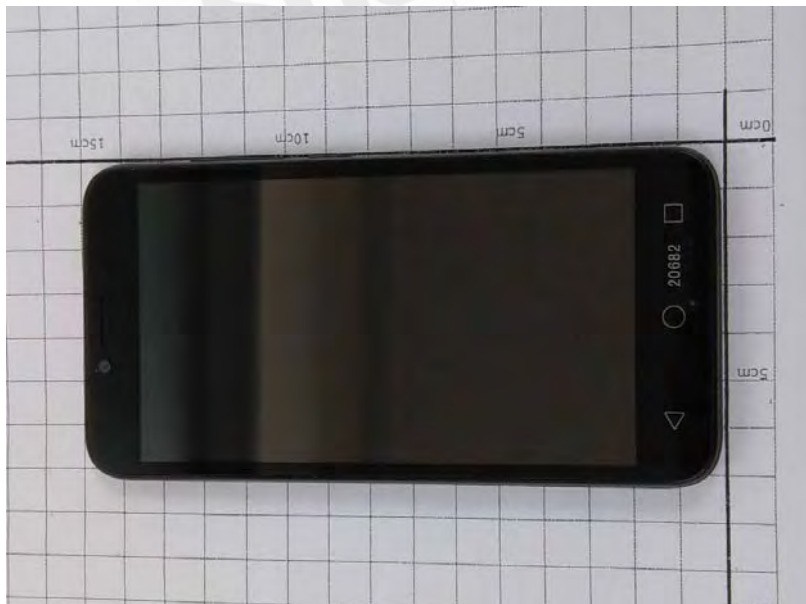
Fig. 3 Front view of EUT