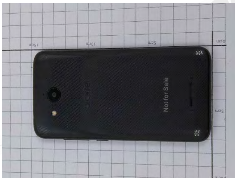
Fig. 4 Back view of EUT