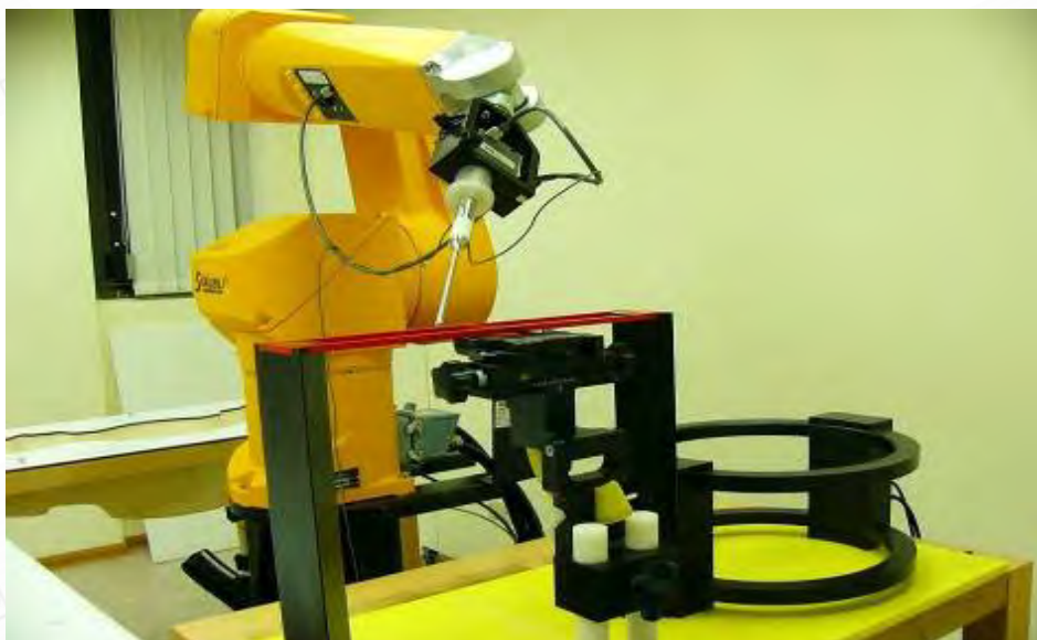
Fig. 1 Photograph of the DASY 5 measurement system