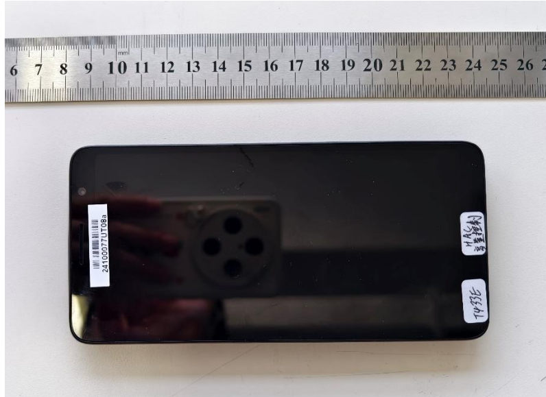
Pic 1 Mobile Phone(top)