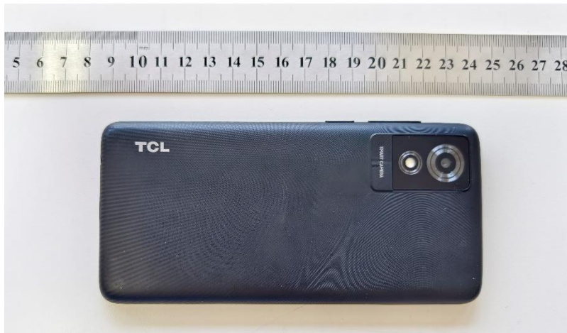
Pic 2 Mobile Phone(back)