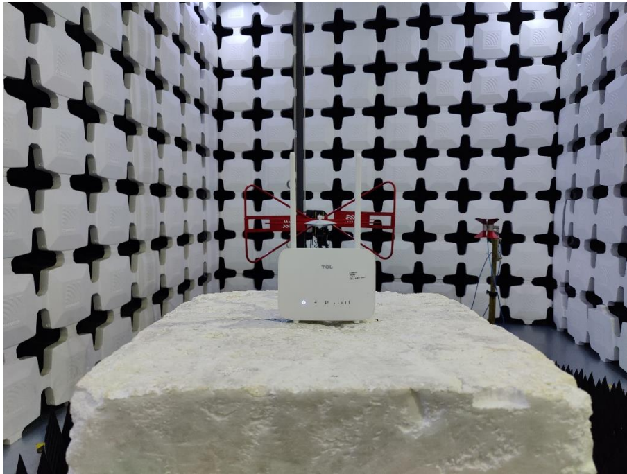
3. Radiated Emissions (Part 22/24/27, 30MHz-18GHz)