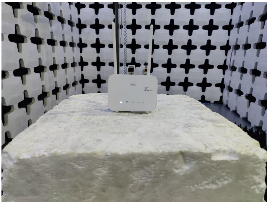
4. Radiated Emissions (Par22/24/27, 18GHz -26.5GHz)