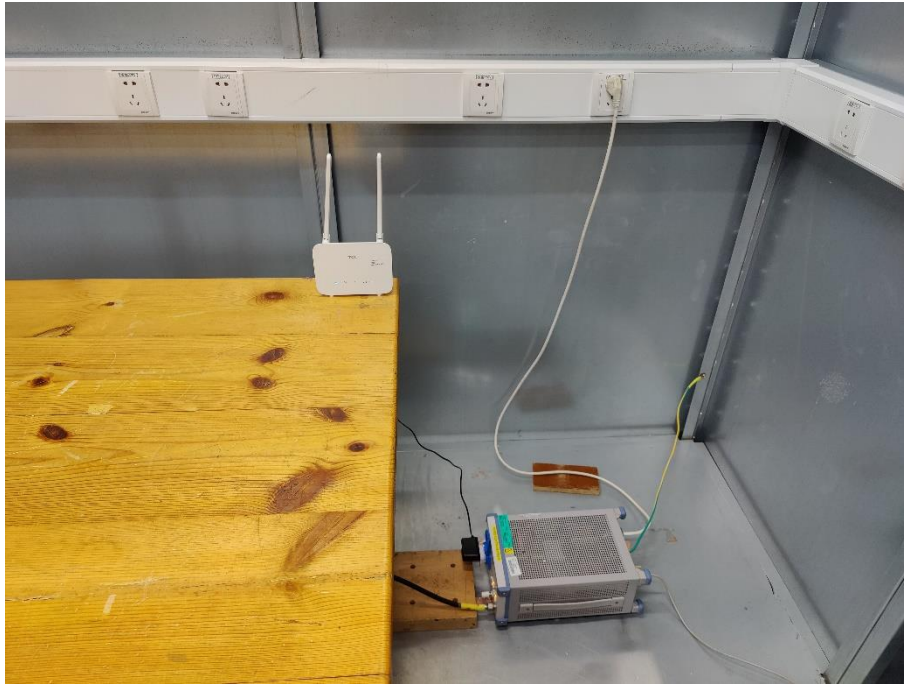
5. Conducted Emission (Part 15B, Wired network function)