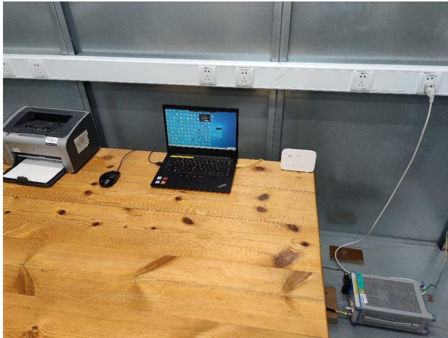
3. Conducted Emission (Part 15B, Wired network function)