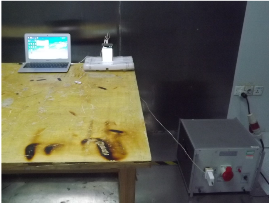
Photograph – Radiated Emission Test Setup for 30~1000MHz at Test Site 2#