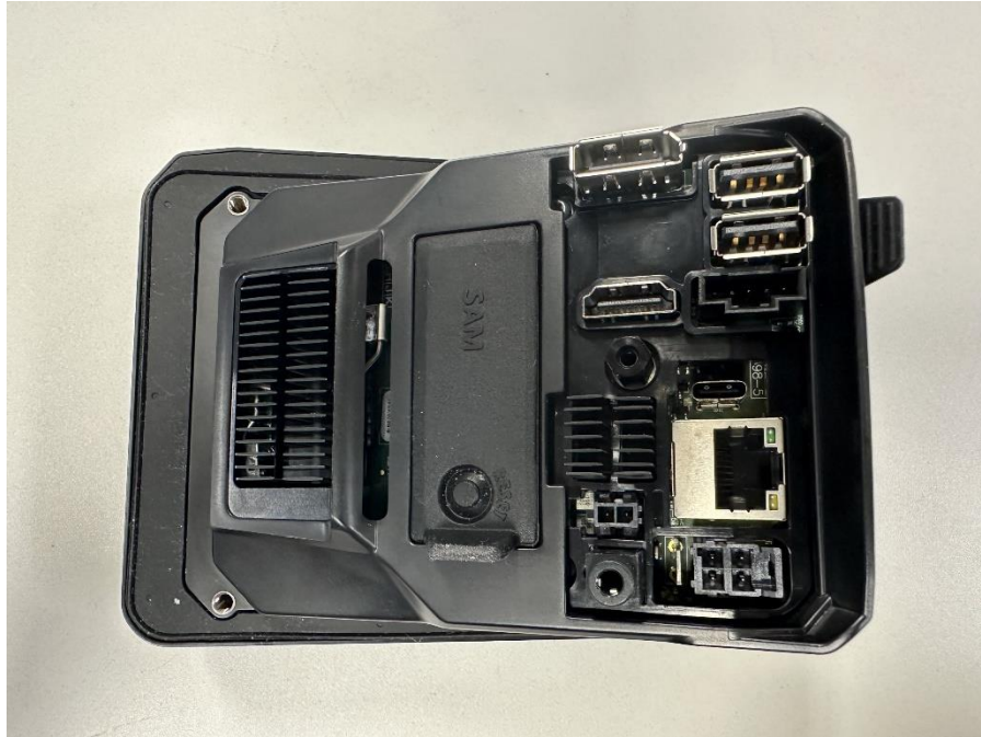
Figure 13 G6-500 OPT/IPT Assembled unit viewed from the back side