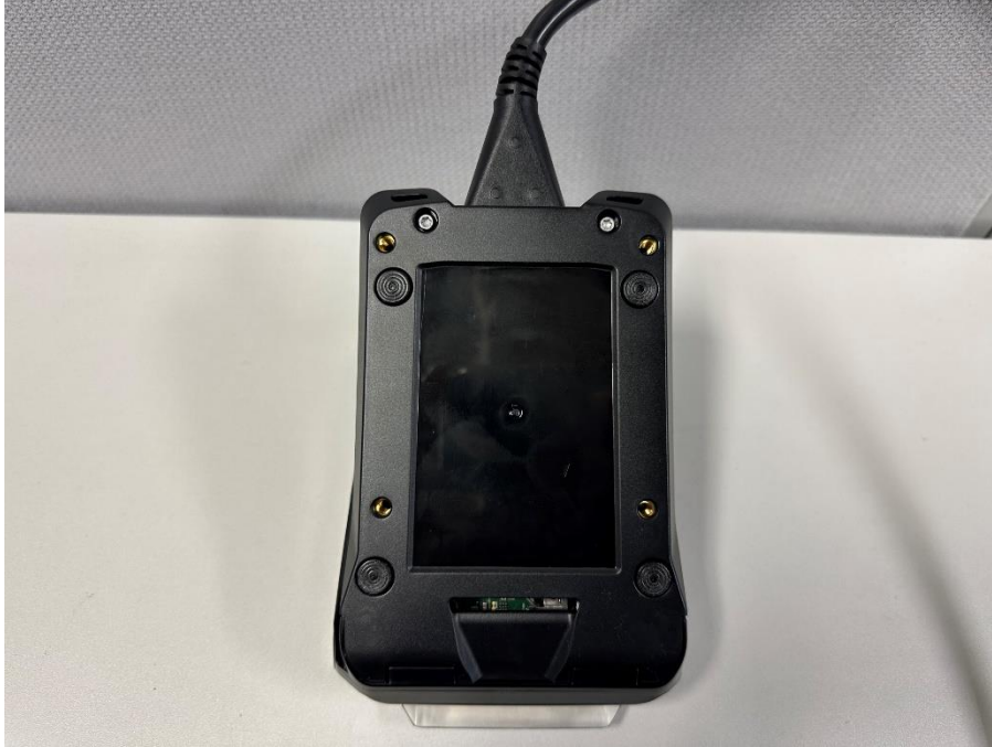
Figure 7 G6-500 IPT, Assembled unit viewed from underside