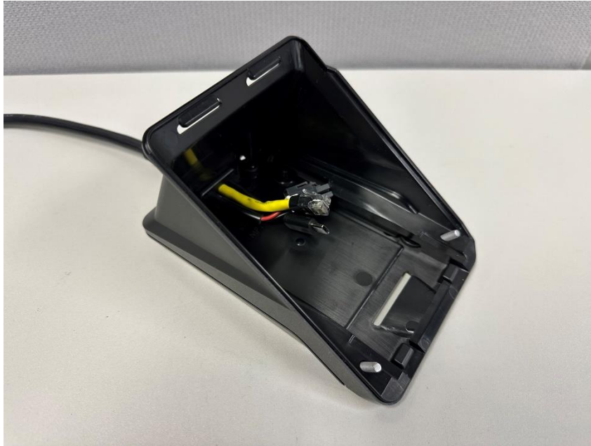
Figure 11 G6-500 IPT, Cradle view