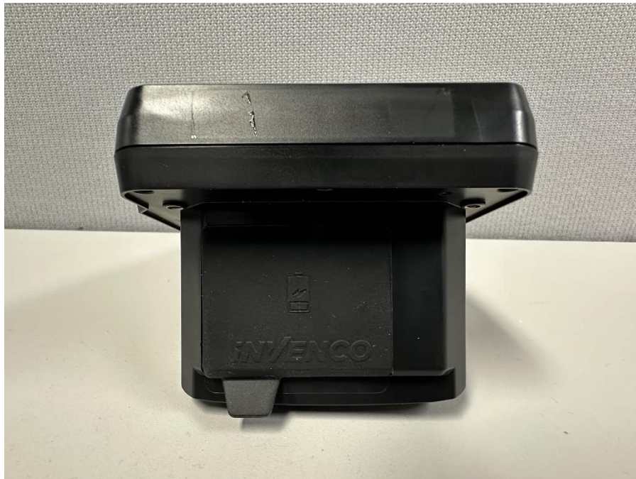
Figure 4 G6-500 OPT Assembled unit viewed from the rear side