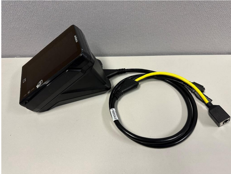
Figure 5 G6-500 IPT, Assembled unit view