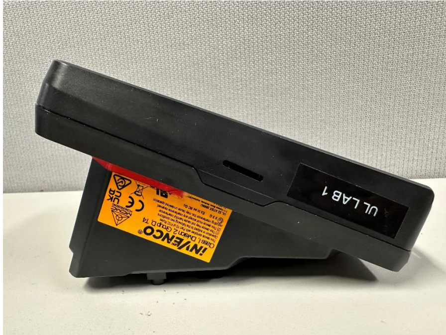
Figure 3 G6-500 OPT Assembled unit viewed from the other side