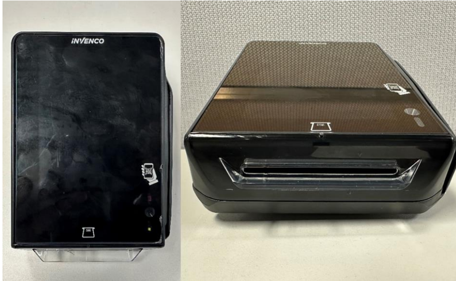
Figure 1 G6-500 OPT Assembled unit viewed from front