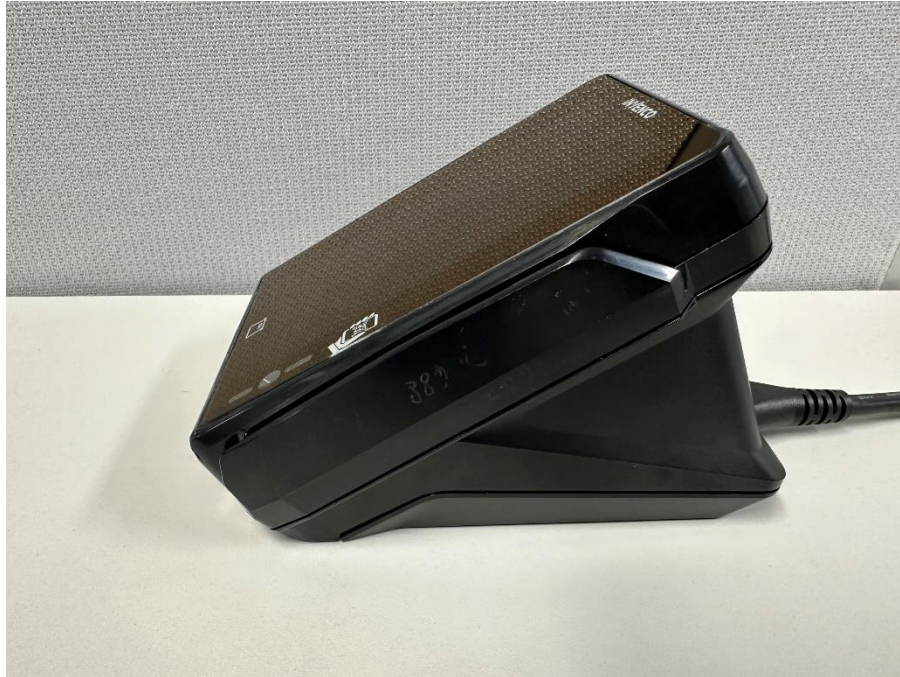
Figure 9 G6-500 IPT, Assembled unit viewed from other side