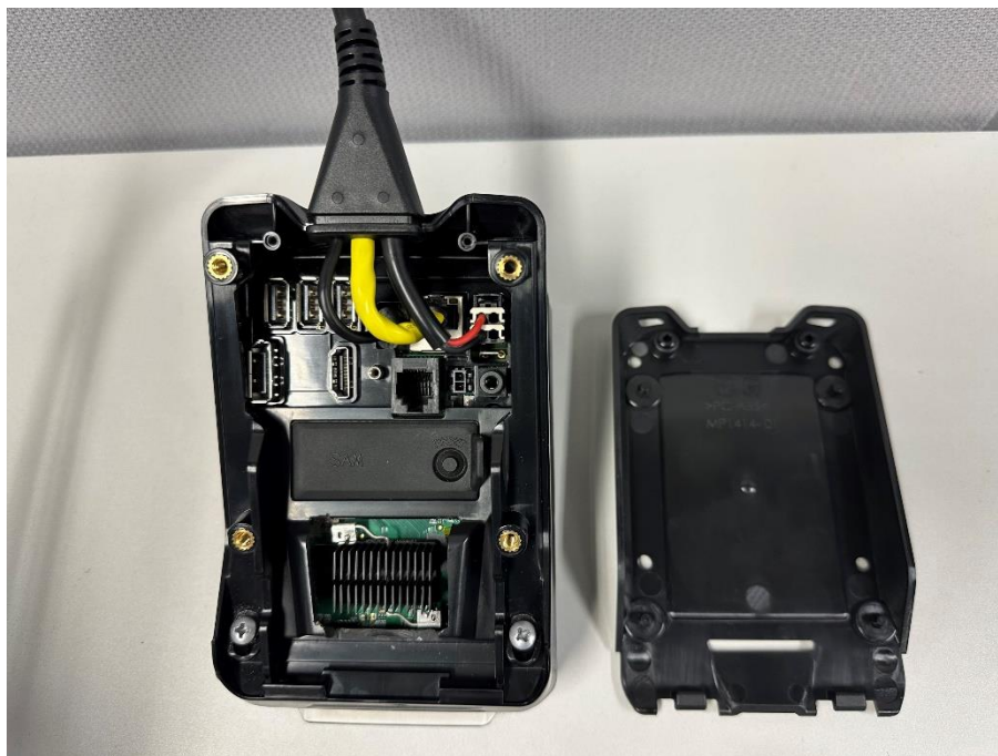
Figure 10 G6-500 IPT, Underside view with rear cover removed