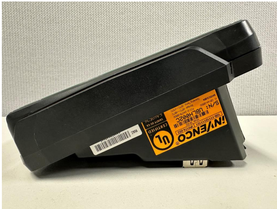
Figure 2 G6-500 OPT Assembled unit viewed from the side