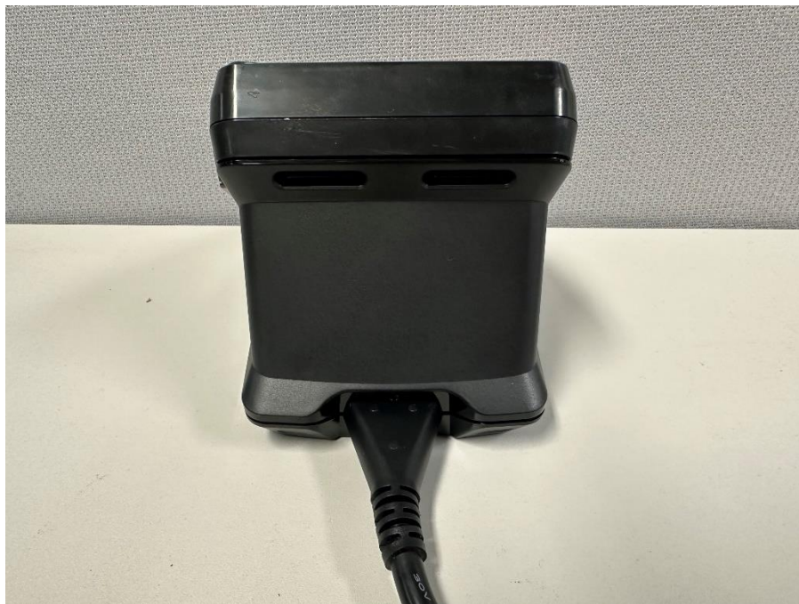
Figure 6 G6-500 IPT, Assembled unit viewed from rear side