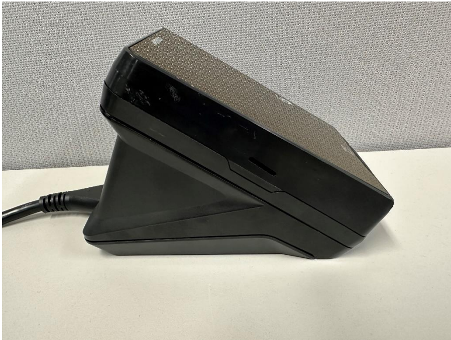
Figure 8 G6-500 IPT, Assembled unit viewed from side