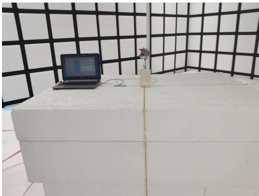
Radiated spurious emission Test Setup-3 (Above 1GHz)