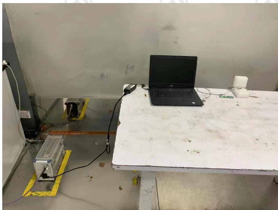
Conducted Emissions Test Setup