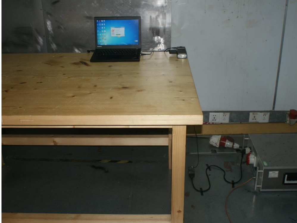
Photograph 3: Set-up for Conducted Emissions