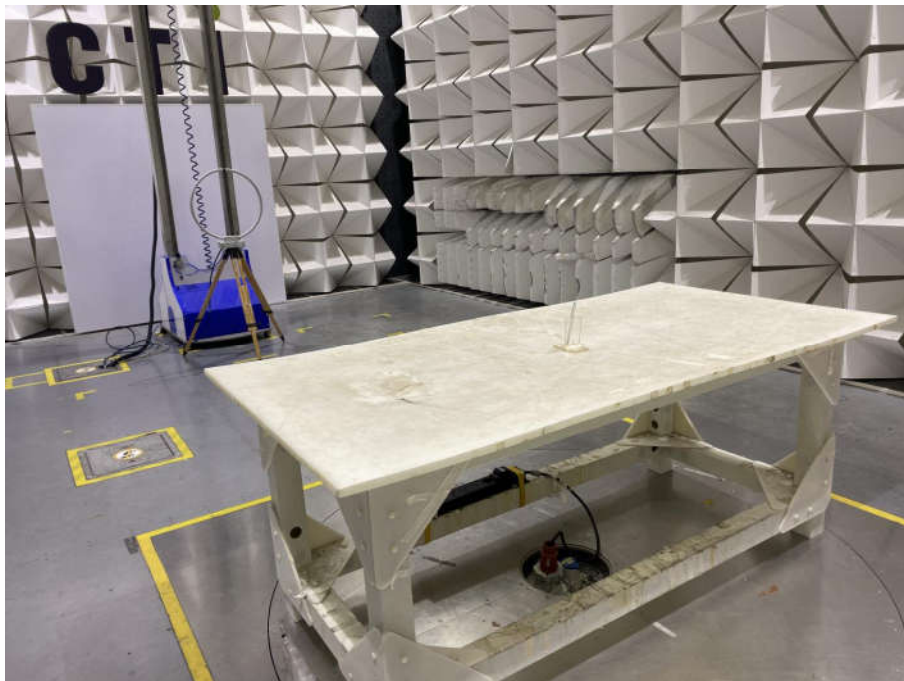
Radiated spurious emission Test Setup-1(Below 30M)