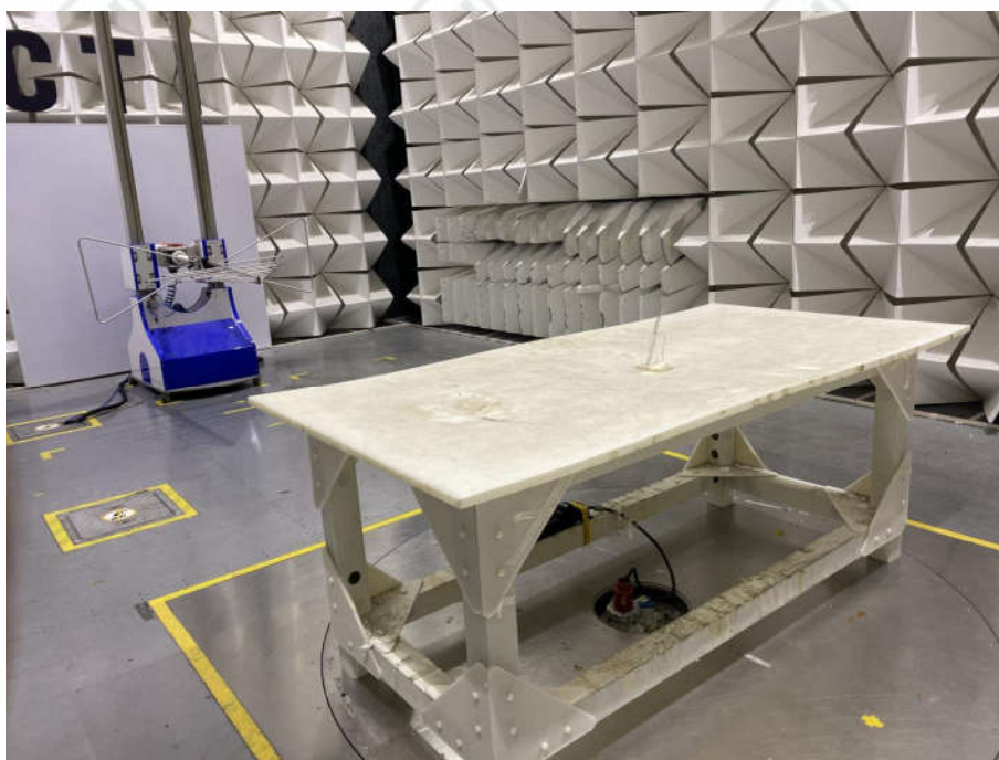
Radiated spurious emission Test Setup-2(Below 1GHz)