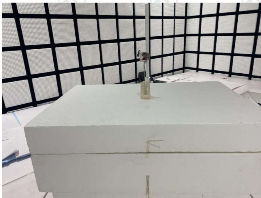
Radiated spurious emission Test Setup-3(Above 1GHz)