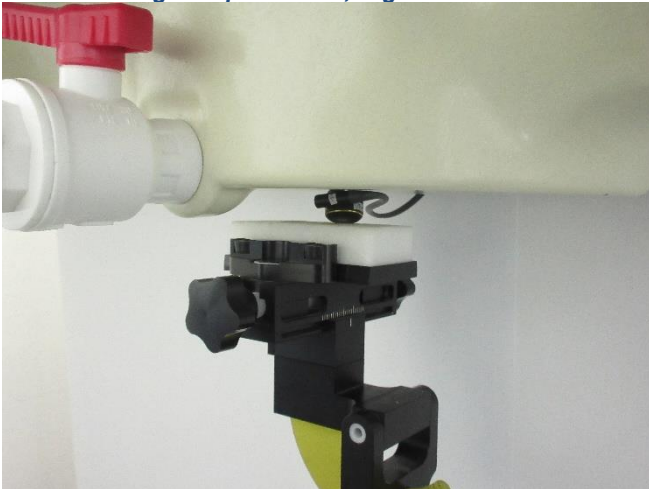
Testing Setup for Head, Right Side at 0 mm