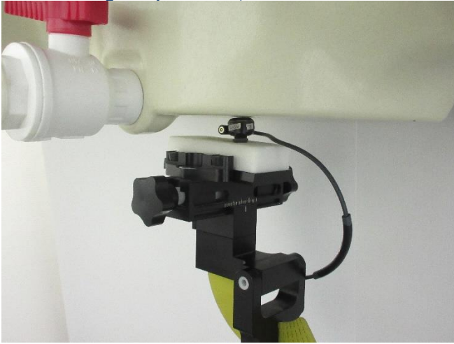
Testing Setup for Head, Front Face at 0 mm