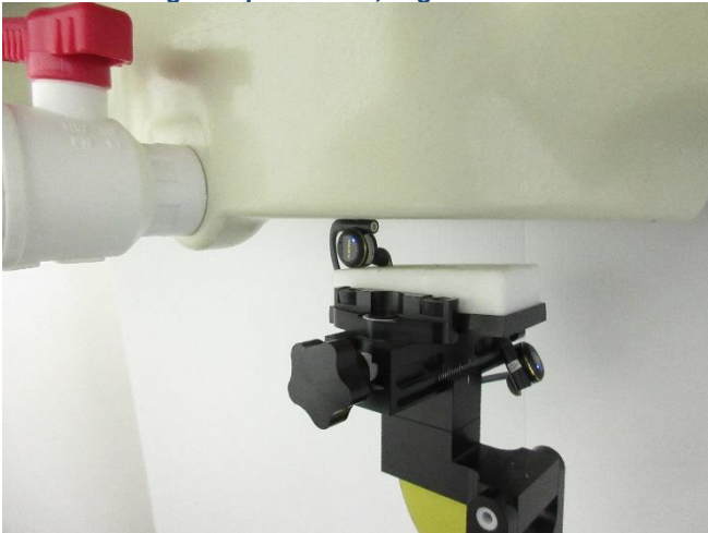
Testing Setup for Head, Right Side at 0 mm