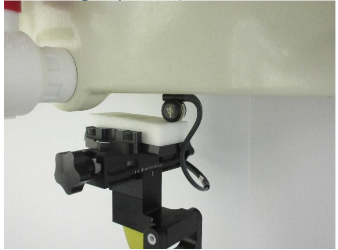
Testing Setup for Head, Rear Face at 0 mm