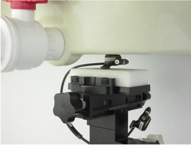
Testing Setup for Head, Front Face at 0 mm