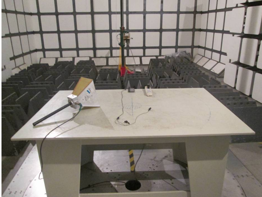
Radiated Emissions –Rear View (Above 1GHz)