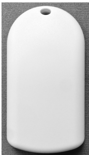
Front of Case Mockup