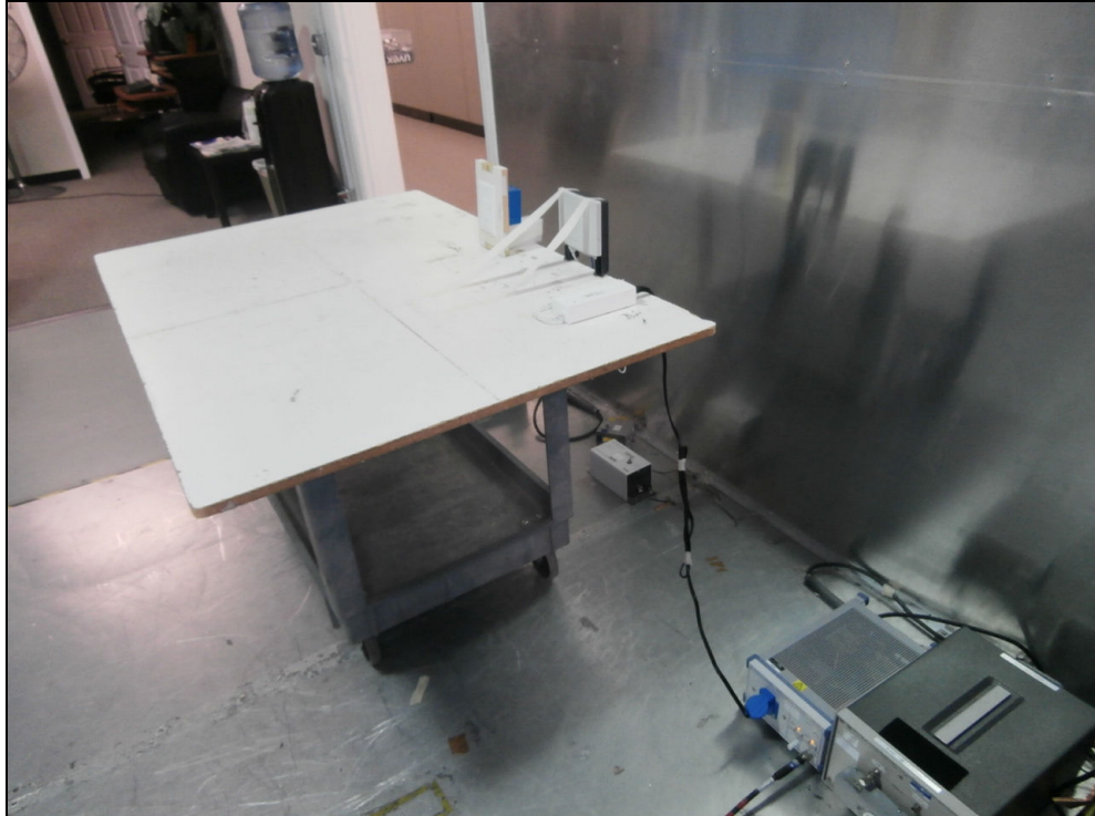
Figure 5: Conducted Emissions