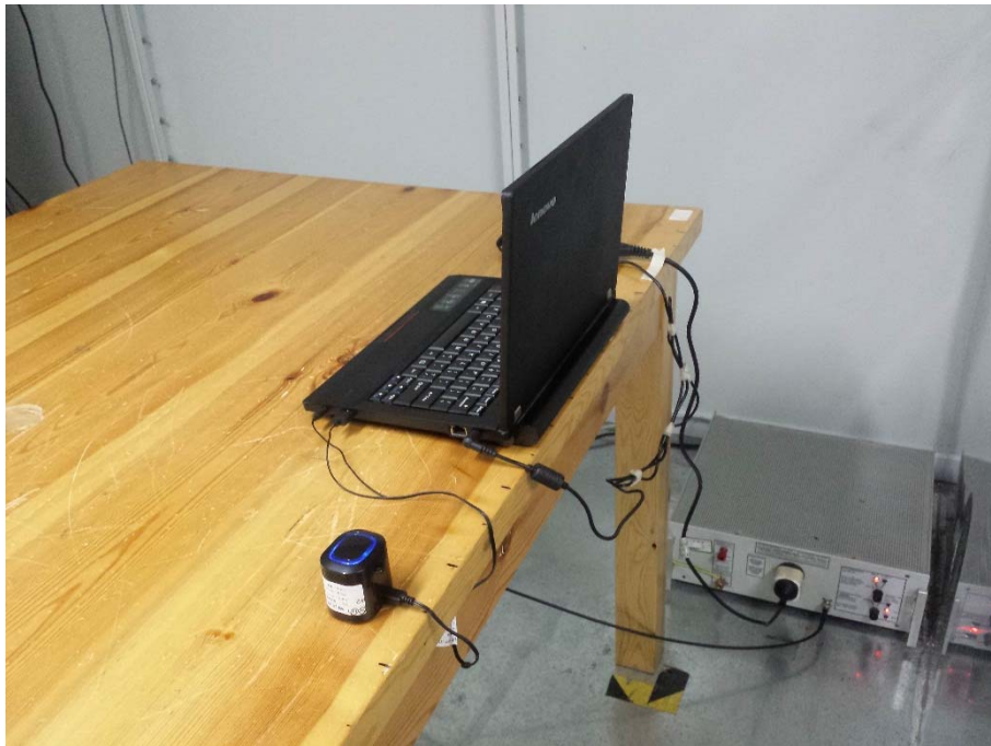
Conducted Emission Test