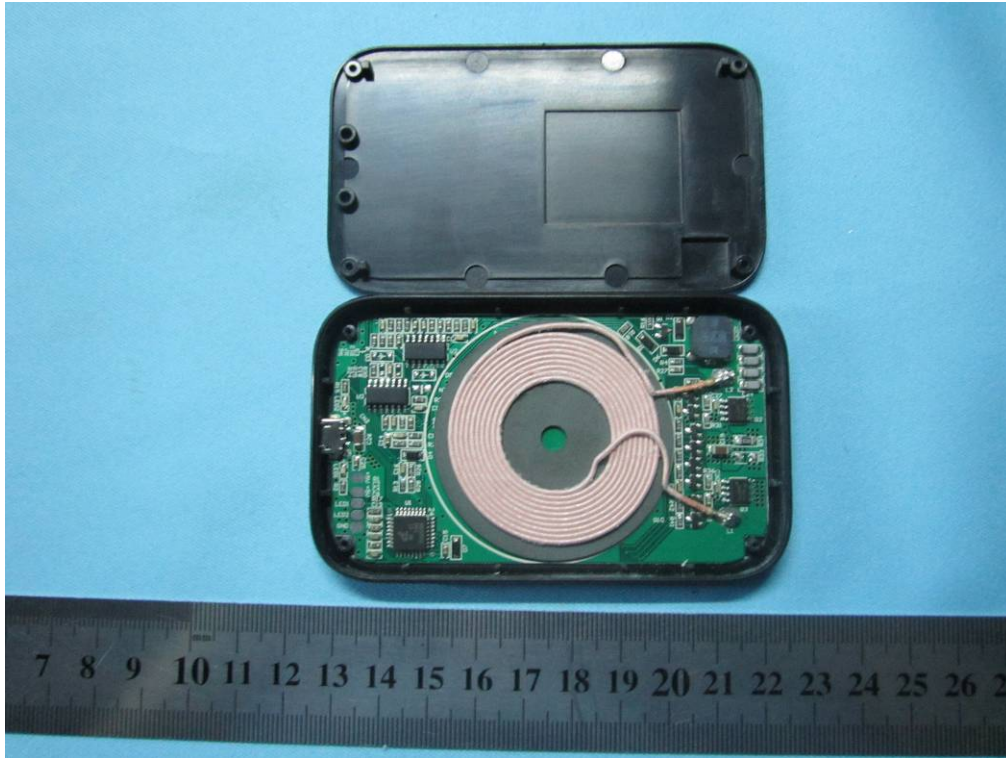
EUT-Cover Off View