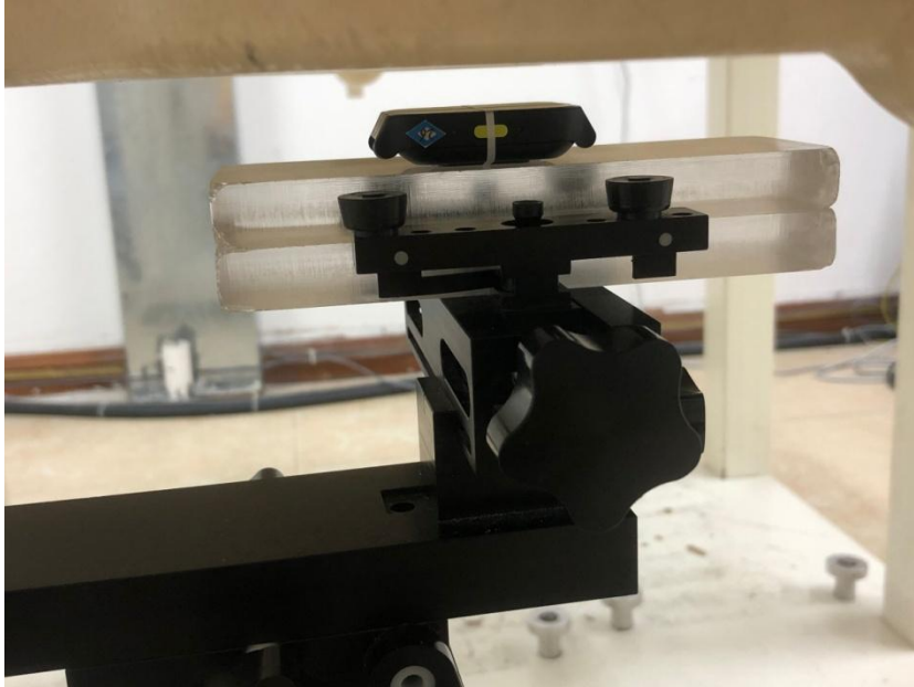
Front Side (Test Distance 10mm)