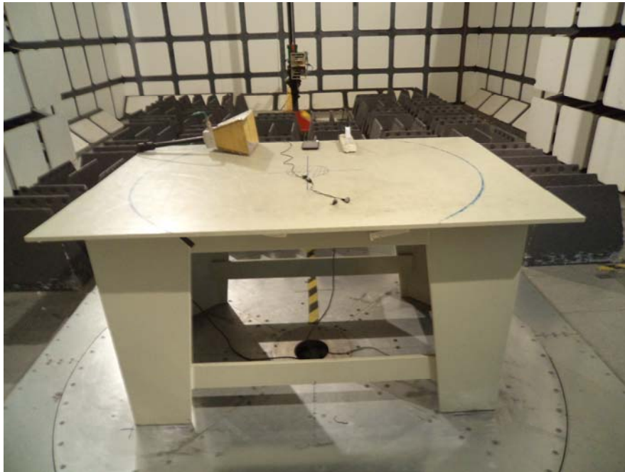
Radiated Emissions – Rear View (1-25 GHz)