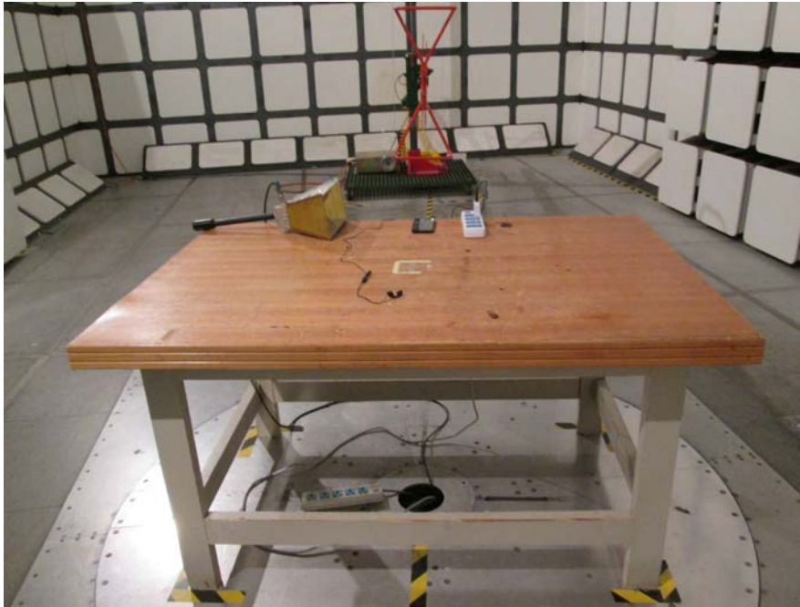
Radiated Emissions – Rear View (30-1000 MHz)