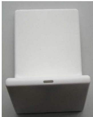
Figure 1: Installed Hygiene Sensor

This is a wall-mounted device that is placed under existing hygiene dispensers throughout the facility. When activated this device measures signal strength of badges located near it and transmits the information to the nearest Location Hub for processing. A picture of an installed Hygiene Sensor is provided in Figure 1.