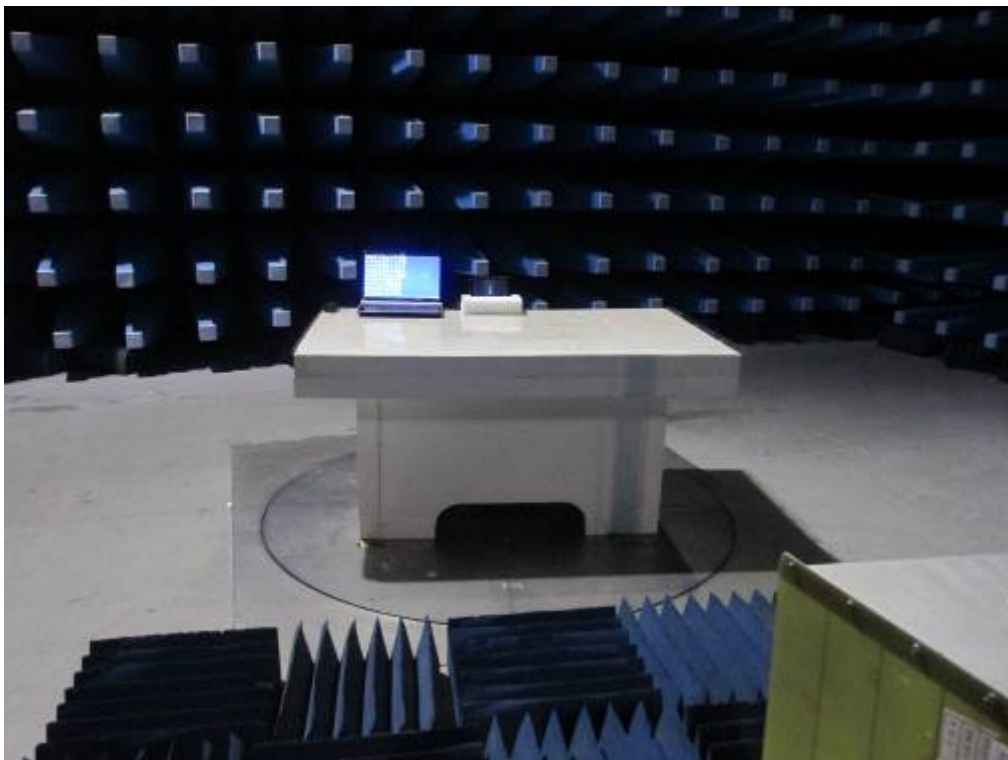
Radiated Spurious Emissions Test Setup Above 1GHz - Front View