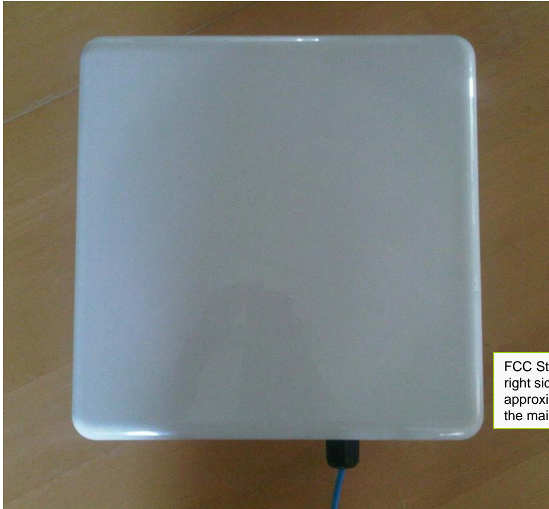
GWS-3000 Front View