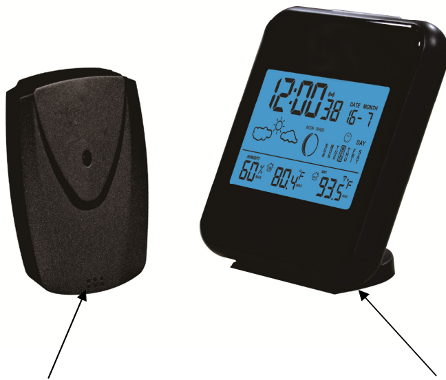
Outdoor Temperature Sensor