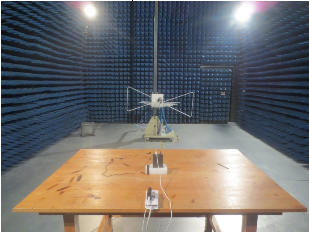
Radiated Spurious Emission