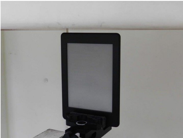
Edge1, Test Separation 0.5 cm