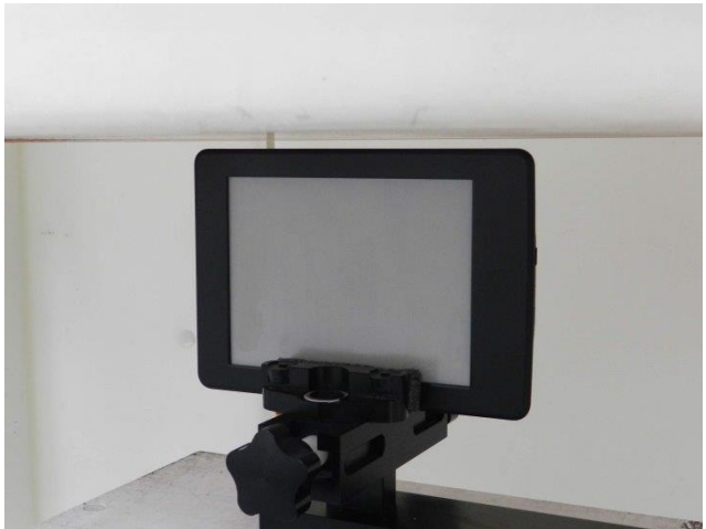
Edge2, Test Separation 0.5 cm