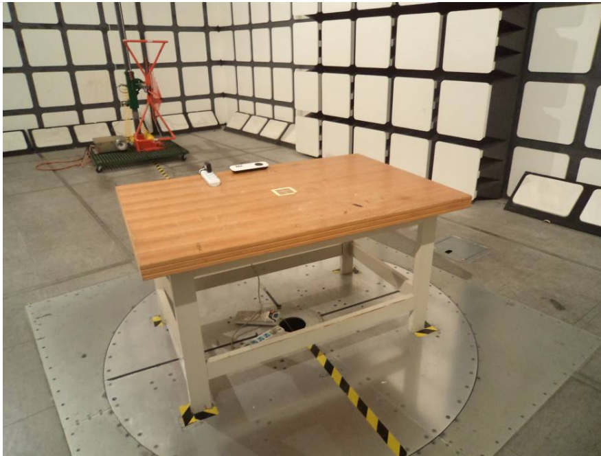
Radiated Emissions – Rear View (Below 1 GHz)