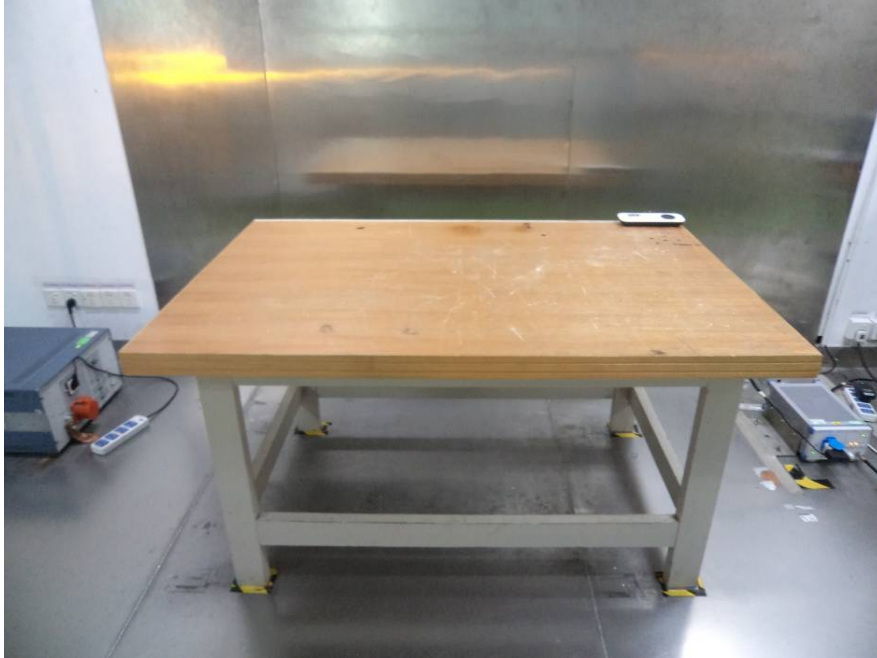
Conduction Emissions – Side View