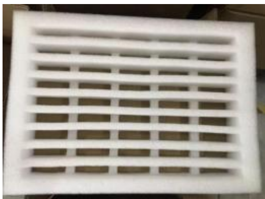
Figure 1: Single-layer foam tray 1 box-pack of 270 PCS