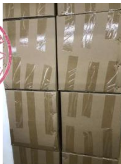
Figure 5: Packaging box label Figure 6: Material stacked, neat and tidy, the label is convenient to find materials