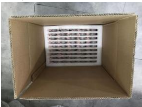
Figure 3: Put in the packing box and place each box