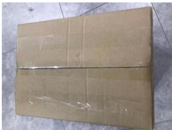
Figure 4: Seal box, seal box with transparent glue

料号: _____ 品名: _____ 规格: _____ 数量: _____ 日期: _____