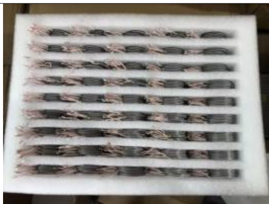
Figure 2: Unified direction line is neatly discharged into the plate,