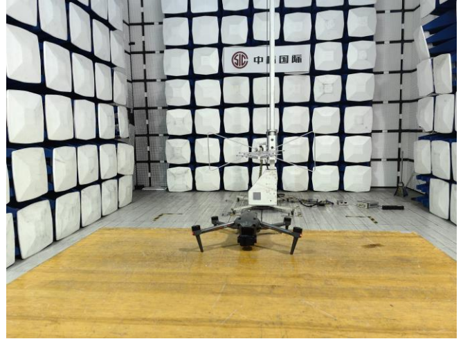
Radiated Spurious Emission Below 1GHz