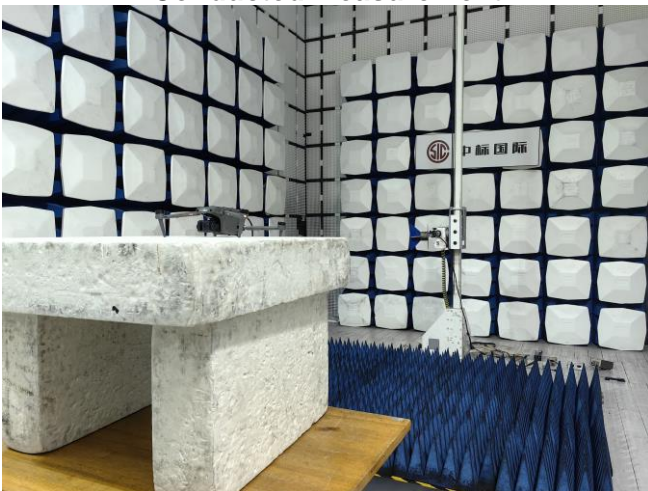
Radiated Spurious Emission Above 1GHz