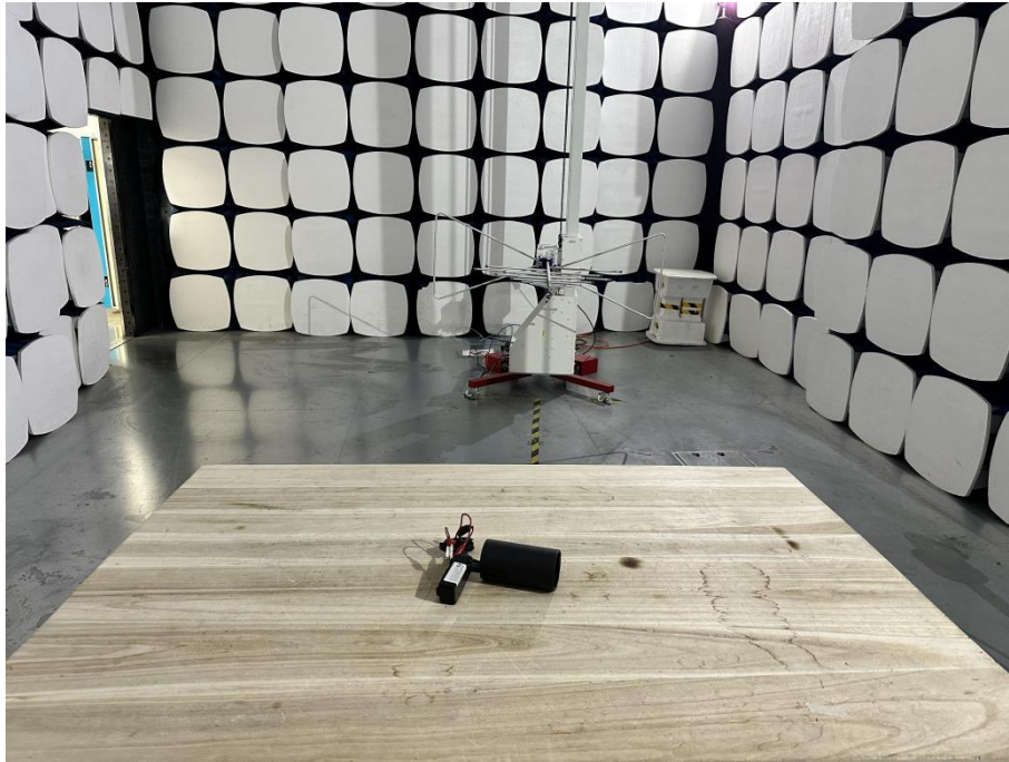
Radiated Emission (30MHz-1GHz)