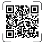
Govee Home App

For FAQs and more information, please visit: www.govee.com