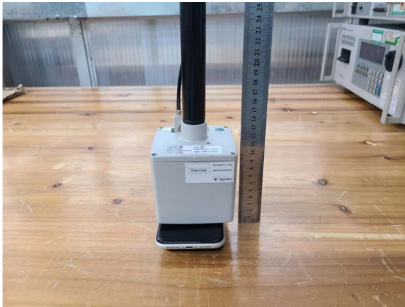
Test Position E-0cm from the edge of EUT to the geometric center of the probe