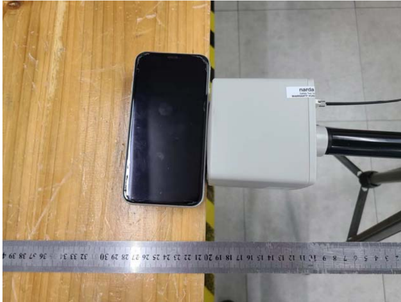
Test Position C-0cm from the edge of EUT to the geometric center of the probe