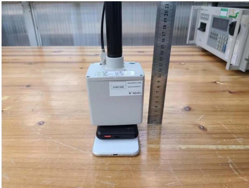
Test Position F-0cm from the edge of EUT to the geometric center of the probe