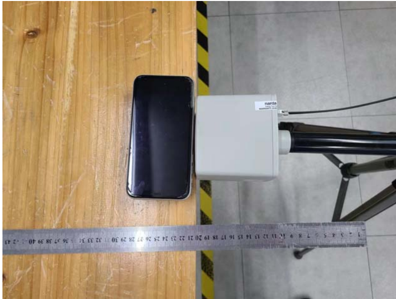
Test Position A-0cm from the edge of EUT to the geometric center of the probe