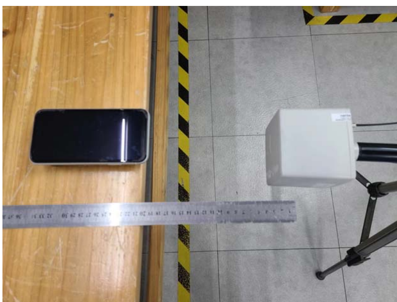
Test Position D-20cm from the edge of EUT to the geometric center of the probe