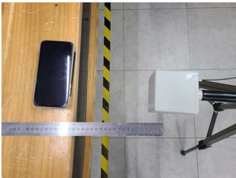
Test Position C-20cm from the edge of EUT to the geometric center of the probe