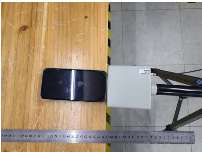
Test Position B-0cm from the edge of EUT to the geometric center of the probe