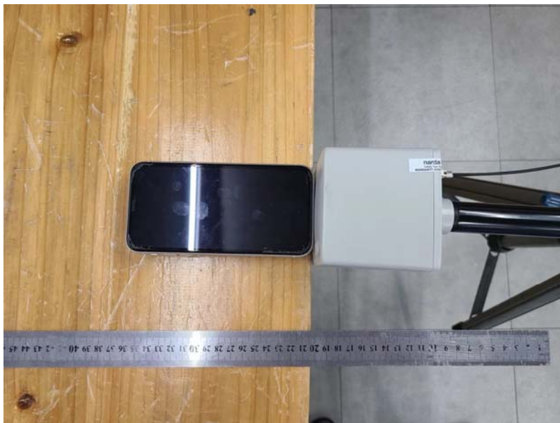
Test Position D-0cm from the edge of EUT to the geometric center of the probe