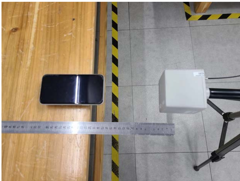
Test Position B-20cm from the edge of EUT to the geometric center of the probe