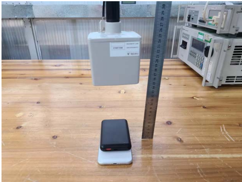
Test Position F-20cm from the edge of EUT to the geometric center of the probe