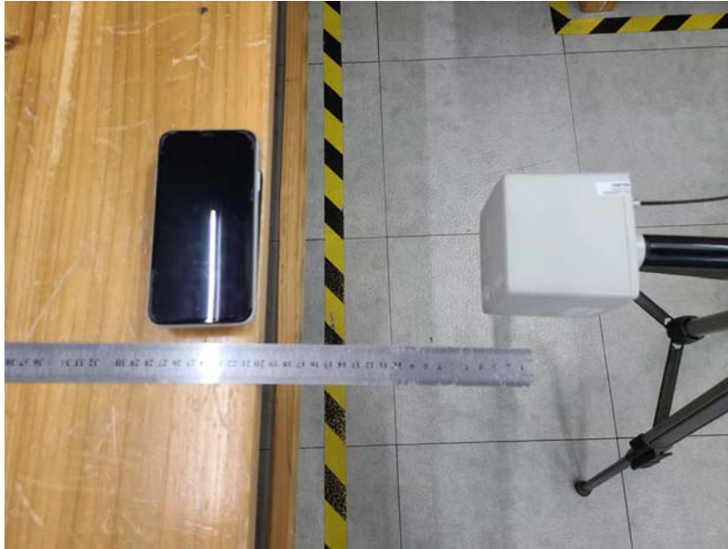
Test Position A-20cm from the edge of EUT to the geometric center of the probe