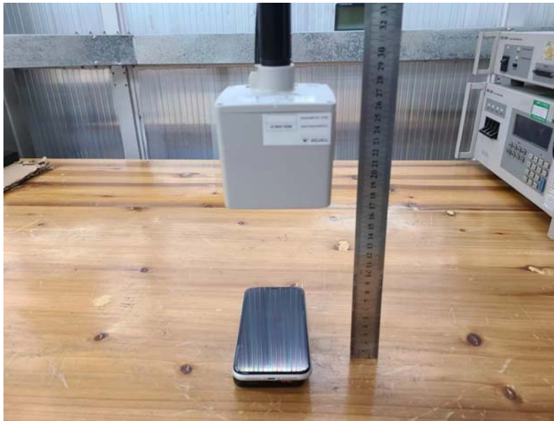
Test Position E-20cm from the edge of EUT to the geometric center of the probe