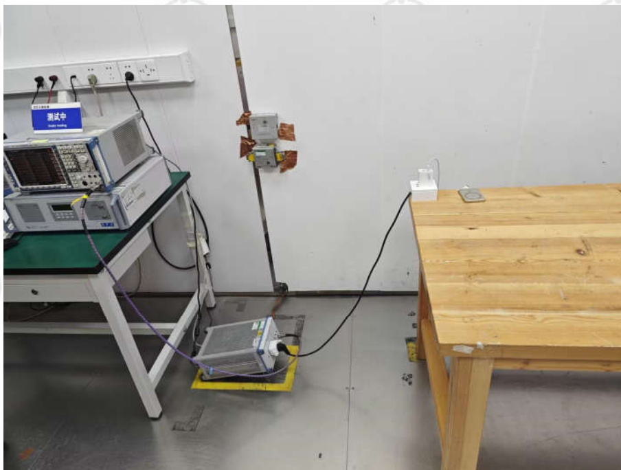
Conducted Emissions(Mode e)