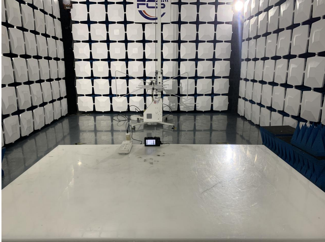
Above 1GHz for radiated emission test setup