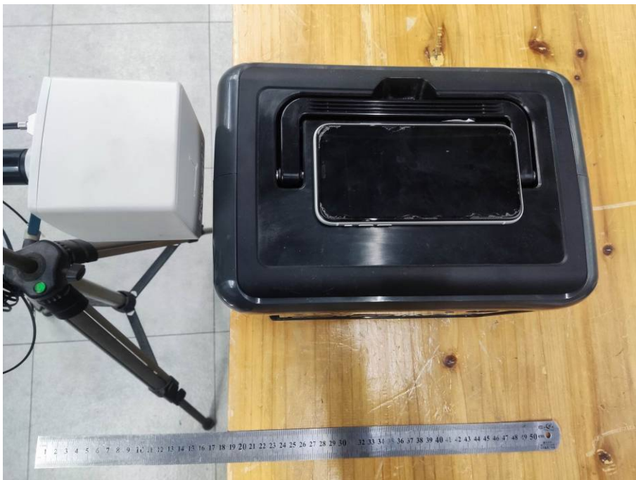
Test Position B-15cm from the edge of EUT to the geometric center of the probe