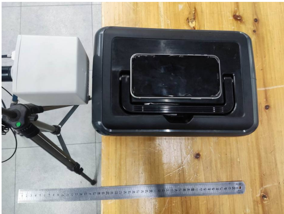
Test Position D-15cm from the edge of EUT to the geometric center of the probe