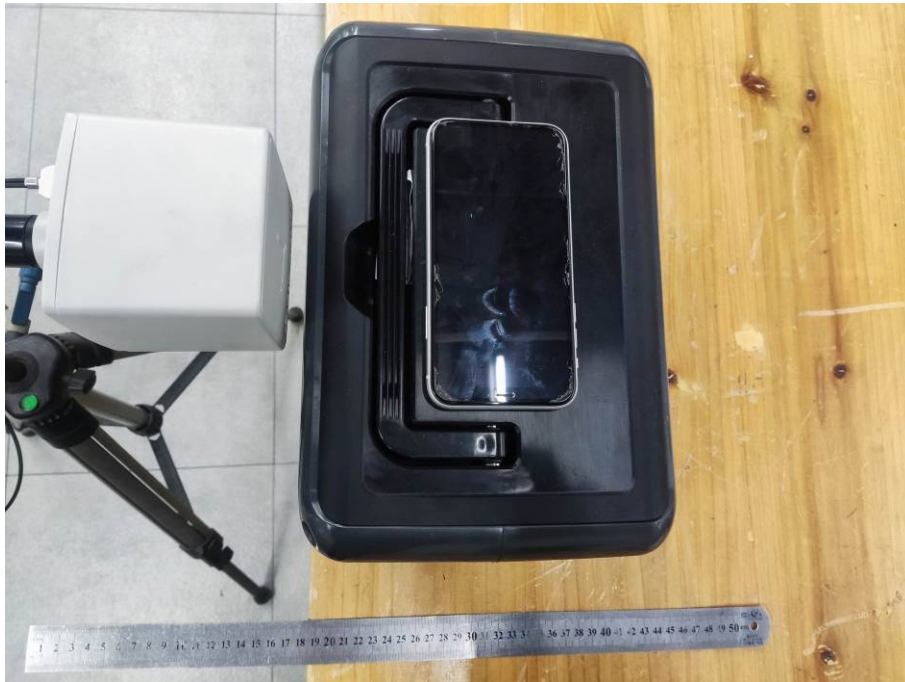
Test Position C-15cm from the edge of EUT to the geometric center of the probe