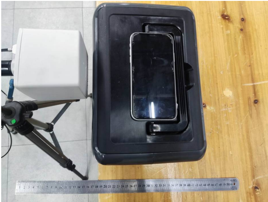
Test Position A-15cm from the edge of EUT to the geometric center of the probe