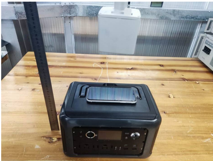
Test Position E-20cm from the edge of EUT to the geometric center of the probe