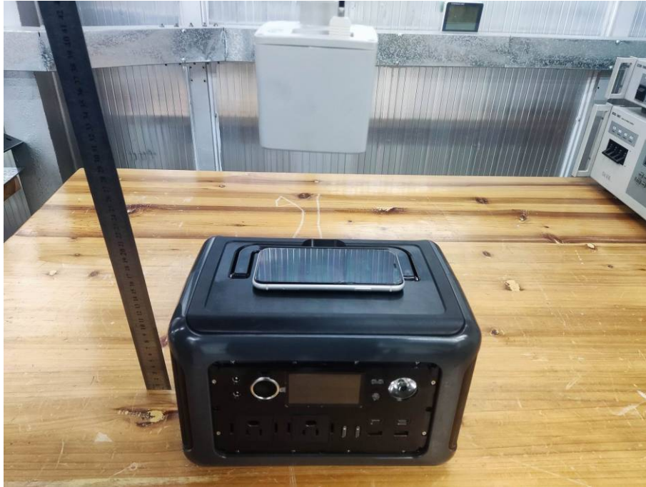
Test Position E-15cm from the edge of EUT to the geometric center of the probe