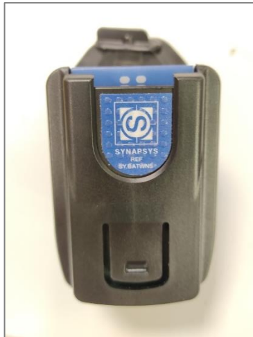
1. Frontal view, battery inserted, LED off