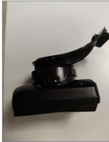
5. View from the side