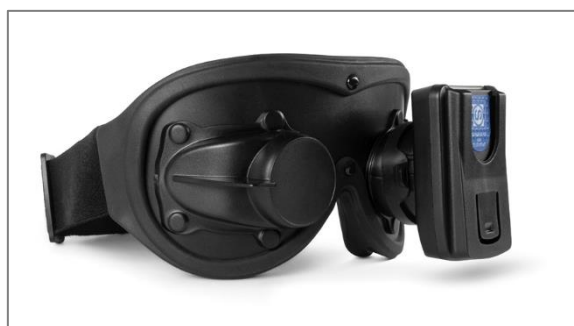
11. Complete device