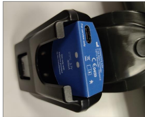
8 View from the top, battery and protection tip for USB cable removed. Different rotation positions of the plastic part that is intended for connection with the goggles.