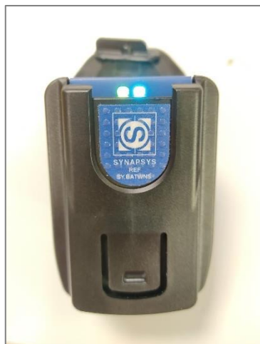
2. Frontal view, battery inserted, LED on