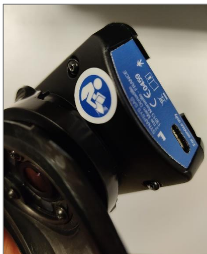
10. View from the patient's side: detail on the label in the upper part.