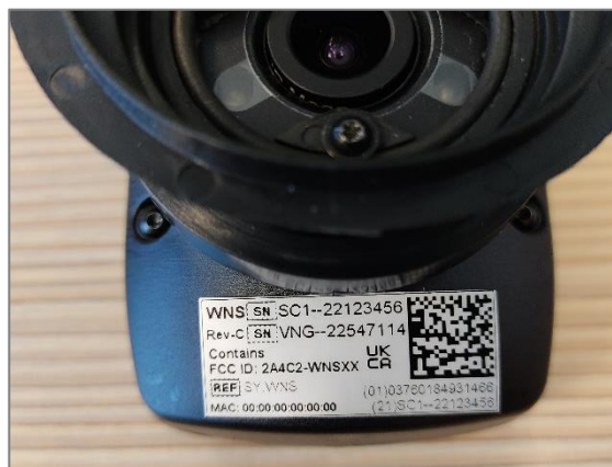
9. View from the patient's side: detail on the label in the bottom part.