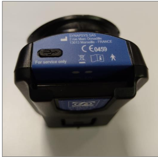
7 View from the top, battery inserted. Protection tip for USB cable removed (left) and inserted (right)