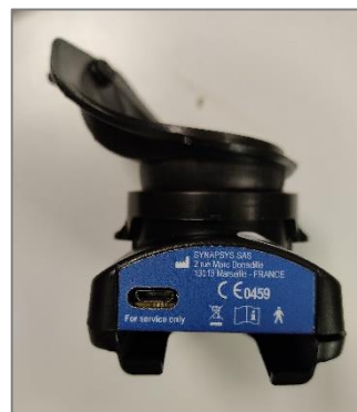
3. View from the bottom (left) and from the top (right)