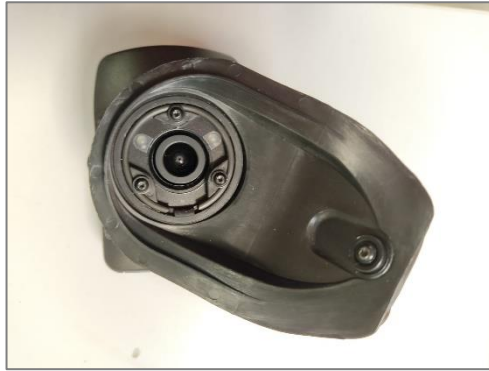
4. View from the patient's side