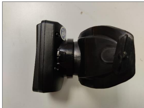
6. View from the side