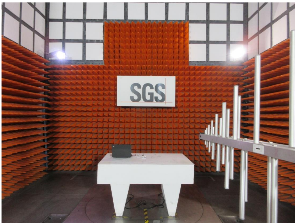
Radiated Spurious Emissions Above 1GHz