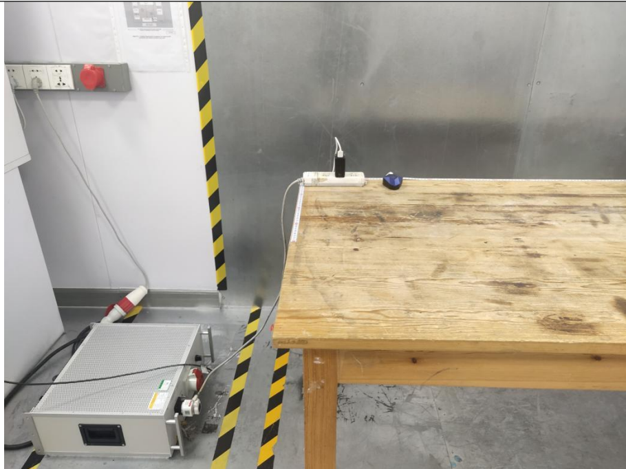
Emissions in frequency bands (below 1GHz)