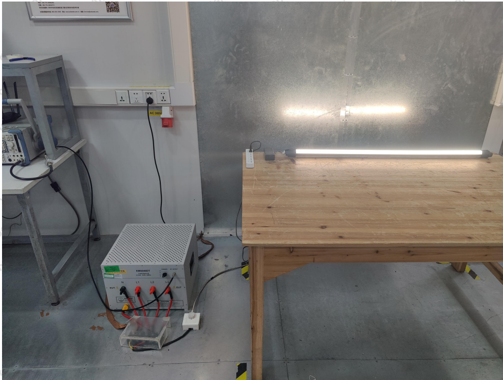
Photo of Radiation Emission Test