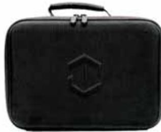
Soft Carrying Case