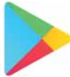
Google Play Store