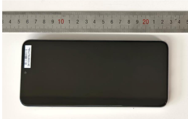
Pic 1 Mobile Phone(top)