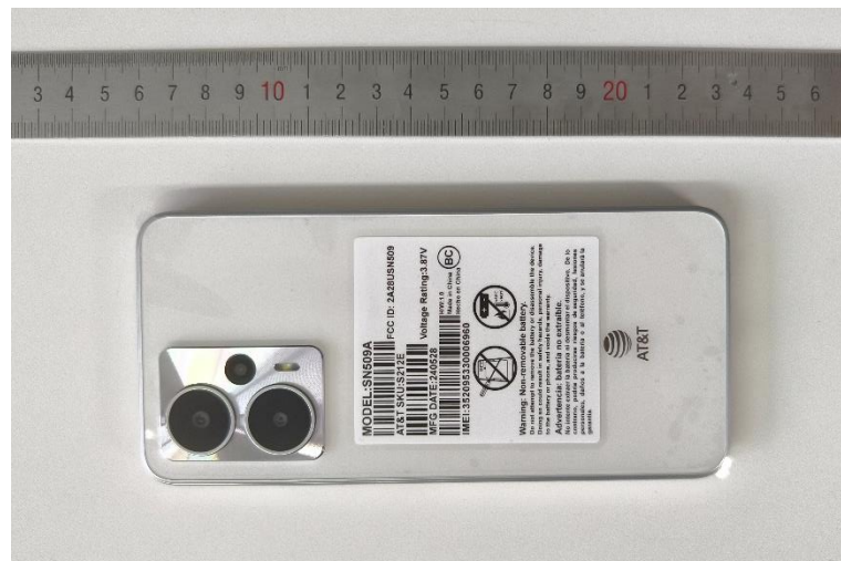
Pic 2 Mobile Phone(back)